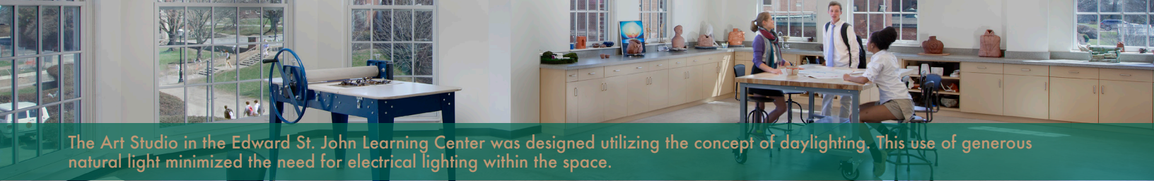
The Art Studio in the Edward St. John Learning Center was designed utilizing the concept of daylighting. This use of generous natural light minimized the need for electrical lighting within the space.